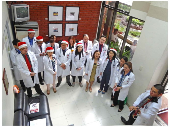
Sa may bahay ang aming bati . . . Adult Cardiology fellows serenaded hospital units and clinics for a touch of Christmas spirit, and some cash. Carolling at the Division of Nuclear Medicine building lobby.