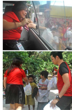
The outreach project is conducted annually as part of the PHC's corporate social responsibility program. Following the Street/Kalye theme of this year's Christmas Celebrations, street children around the vicinity of PHC received loot bags.