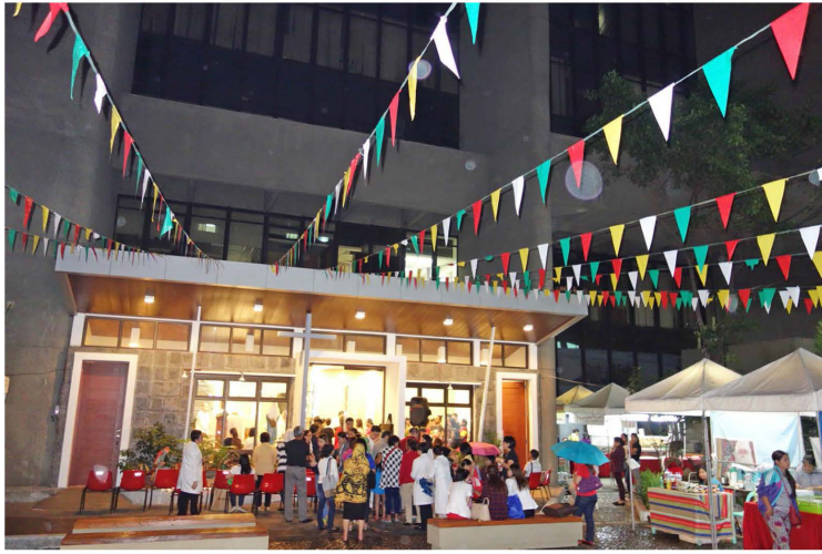
Simbang Gabi 12.18.2015. The Chapel seems like an oasis of calm and spirituality, oblivious to the Street Party and Rakrakan raging inside the DAPA Hall just next door.