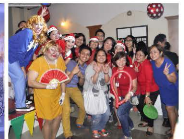
The KalyeSerye portions are nothing less than full-blown production numbers. The Administrative Services group give a crowd-pleasing performance (left). But Medical Services squeak by on points and win the KalyeSerye contest (below).