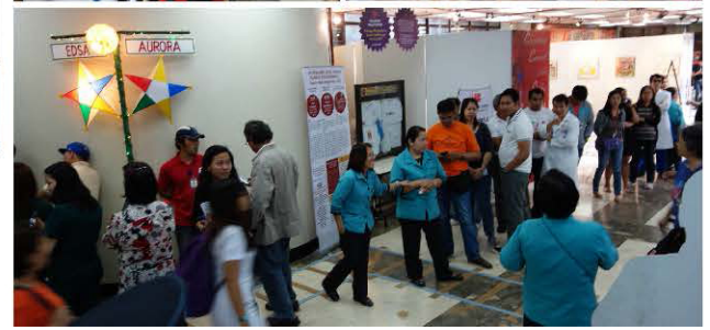
(Above left and middle) The Secretariat take a quick photobooth shoot before tackling the massive queues that have formed starting at 10 am, even though registration was scheduled to start at 12 noon for the 1:30 pm program.