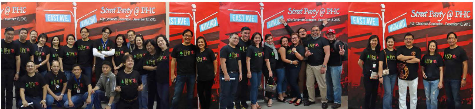
(Below left and middle) Members of the Organizing Committee (including most of the committee chairs) pose for posterity before the start of the program. The backdrop was a very popular photo-op spot with the employees too, helping to make the 40th Christmas Celebration the most memorable ever.